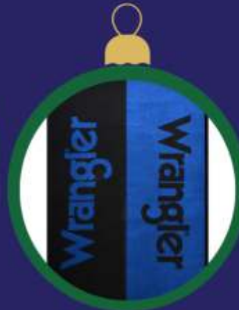
Wrangler Towels $58.50