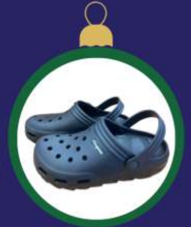
Mens Clogees $35.99