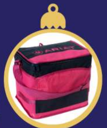
Ariat Cooler Bag $49.50