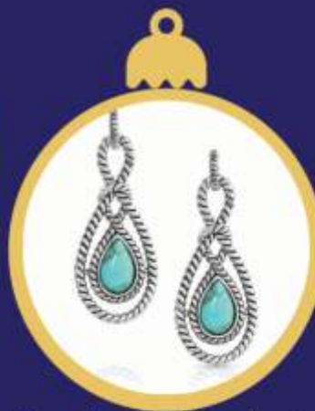
Montana Earrings $148.50