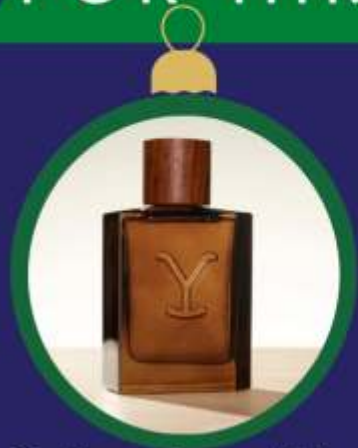
Yellowstone Ride Cologne $85.50