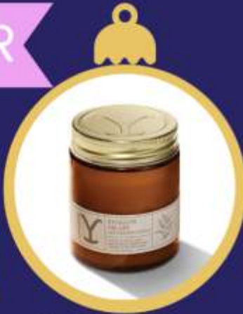
Yellowstone Candles $53.95