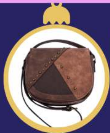
Pure Western Samara Bag $80.95