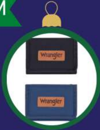
Wrangler Logo Wallet $31.50