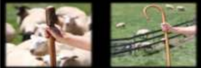
They comfort me.