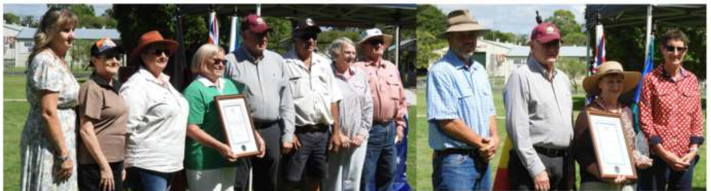
Community Event Award