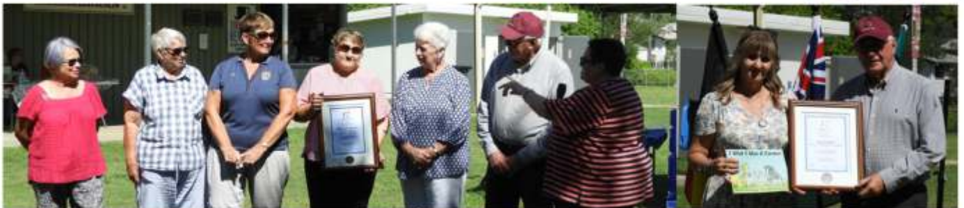
Community Group Award