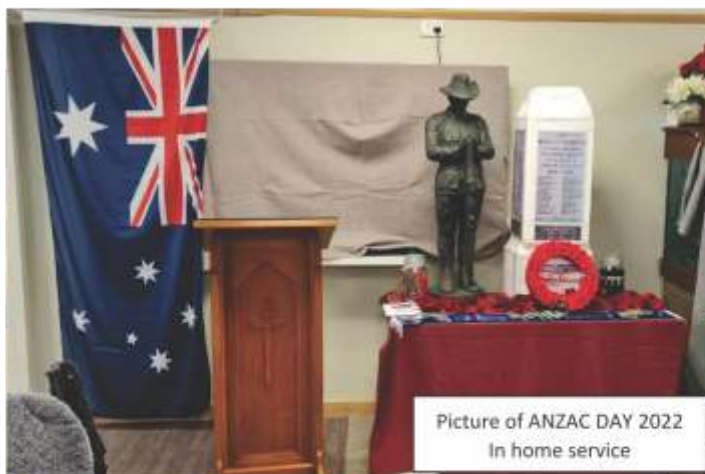
Picture of ANZAC DAY 2022 In home service

We will be looking at taking the residents to the Millmerran Museum, Road trips to Cecical Plains, Leyburn and Towoomba. This year we are pleased to be participating in the 2023 ANZAC march in Millmerran on ANZAC DAY. We have a number of residents who have indicated they would like to take part in the march.